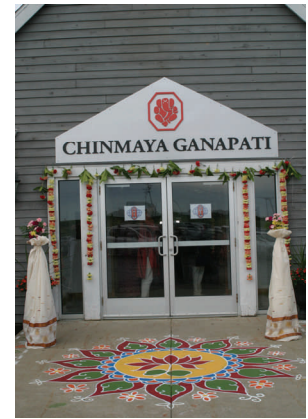
Entrance decorated with rangoli and flowers

Preparation and Transformation CMTC closed on the property in Chaska on Gurudev's birthday, May 8. Board members and families came together for a pooja ceremony on July 4 th . The pooja performed invoked Lord Ganapati, Goddesses Durga, Lakshmi, and Saraswati's blessings. Panditji offered prayers to Puja Gurudev and performed the Kalasha, Navagraha, and Vaasthu Shanti pooja. This started the preparation for transforming this building into Chinmaya Ganapati. The core members and volunteers worked tirelessly for the next 10 days as a family...it felt like preparing for a wedding! There was not only participation from members here but from our extended family in India. Chinmaya Mission Kolkotta members made garlands and presented a beautiful Tanjore painting of Ganapati. Chinmaya Mission Delhi members sent a 10 ft long toran to adorn the Altar and many other decorative flower garlands.